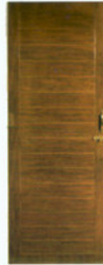
Rustique - 01