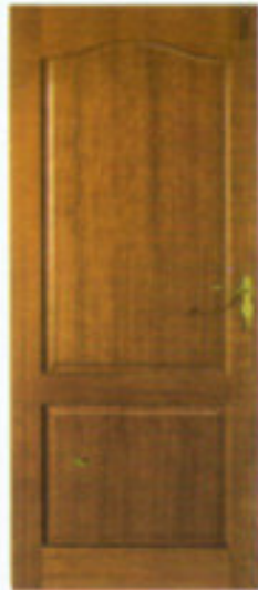
Classique - 01