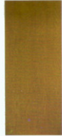
Provincial - 01