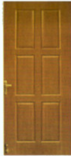
Elite - 01