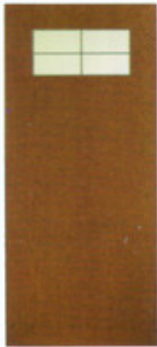
Rural - 01