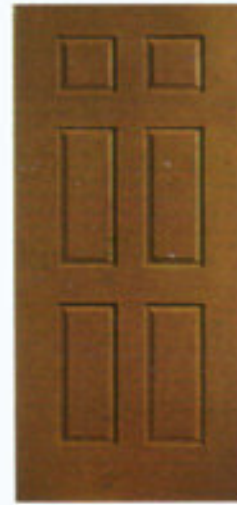
Colonial - 01