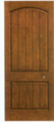
Antique - 01