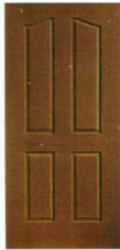
Kinwar - 01