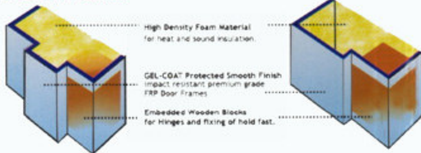
Double Rabbet Frame